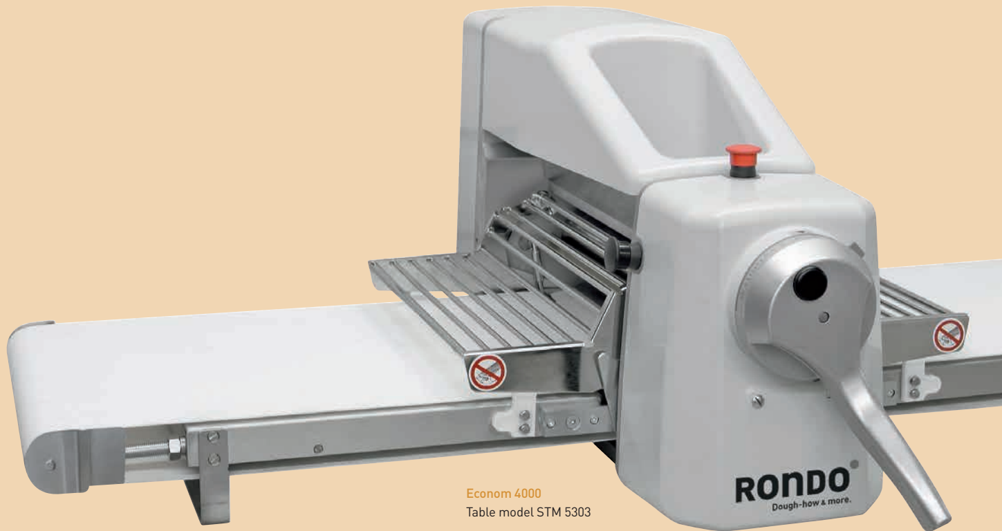
Econom 4000 Table model STM 5303

The Econom sheets dough gently and precisely and only uses a minimum of space. With its 500 mm working width, it is the ideal dough sheeter for narrow areas, for example in hotels, restaurants, pizza shops, canteen kitchens, and artisanal bakeries and confectioners.