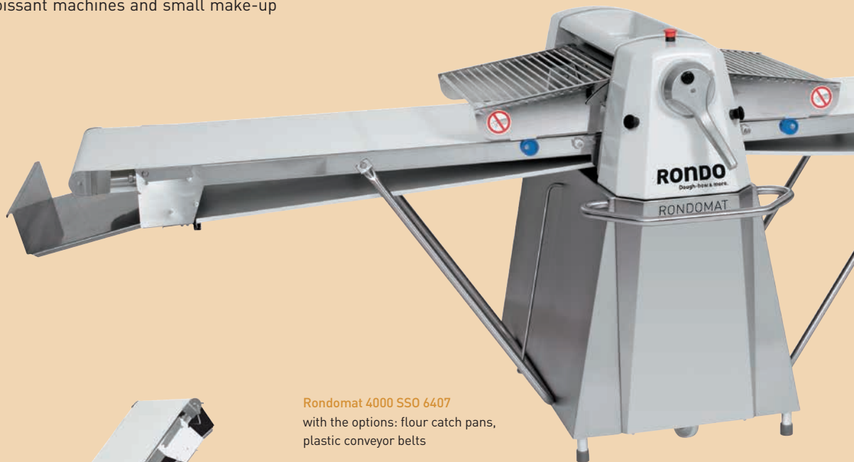
Rondomat 4000 SSO 6407 with the options: flour catch pans, plastic conveyor belts

The Rondomat is the right dough sheeter for small to medium-sized bakeries. It features a rugged and ergonomic design. With the Rondomat, you process all types of dough gently to form consistent blocks and bands of dough. The working width of 650 mm even allows you to feed cutting tables, croissant machines and small make-up lines.