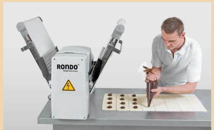
When not in use, the tables are simply folded up and you gain valuable working space.