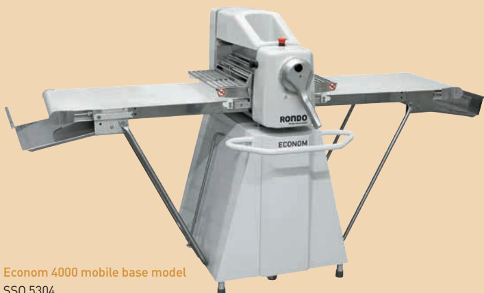
Econom 4000 mobile base model SSO 5304