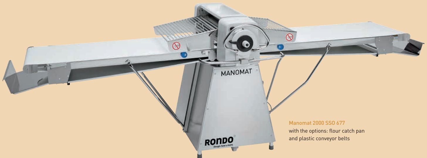
Manomat 2000 SSO 677 with the options: flour catch pan and plastic conveyor belts

With the Manomat and Automat, you quickly process particularly large quantities of dough. You can also work effortlessly in multiple shifts. Numerous elaborate details ensure maximum operator convenience. The design is extremely rugged and smooth surfaces made of stainless steel make cleaning simple.